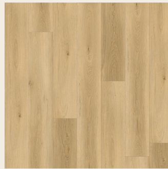
MEL907 Long Point