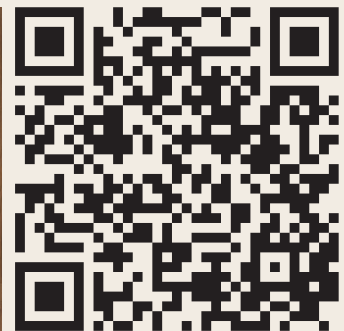
Scan to visit product page